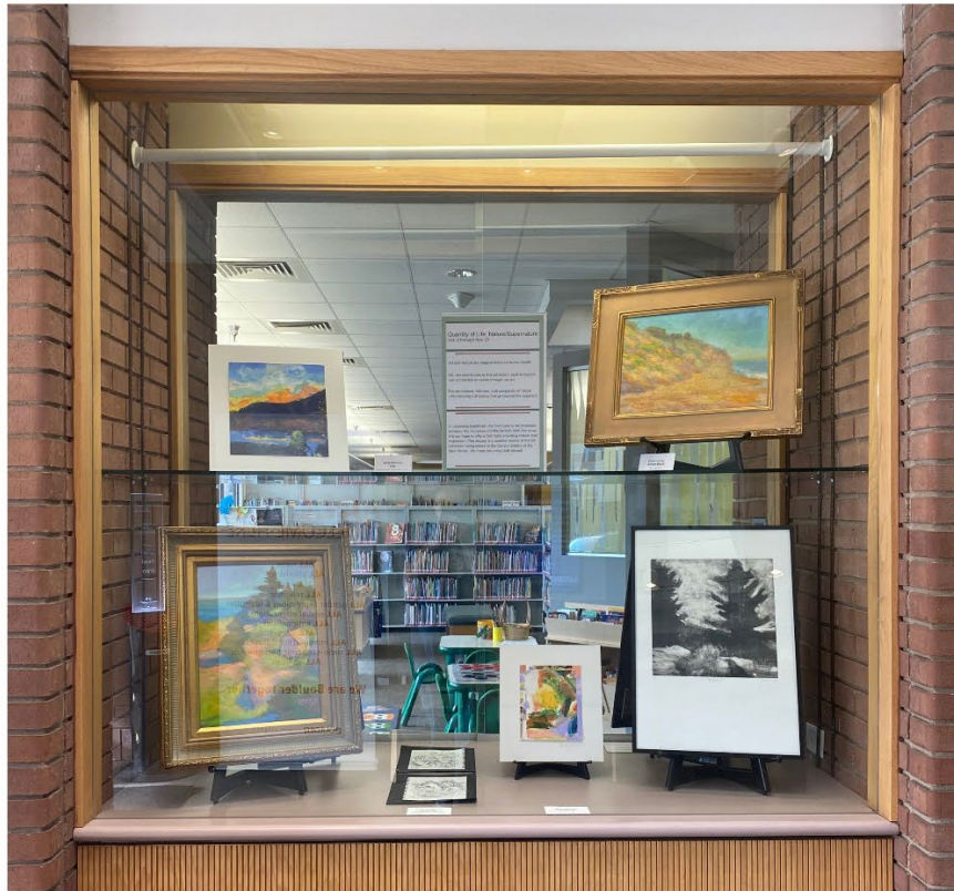
Current Exhibition (2022)