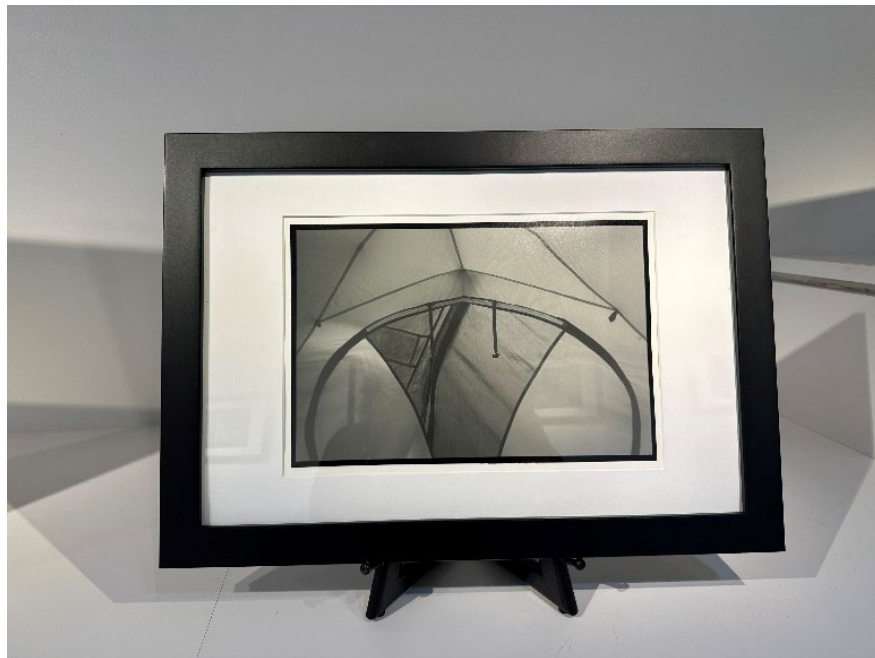
Small wooden easel for framed 2D artwork

Exhibitors are expected to review the below diagram of the display case at Meadows which contains the dimensions of the space. The shelf in the middle of the case is glass and both the front and back of the case are also glass. This means that all displays must be planned to be seen from both the front and back of the case since library patrons will view it from both sides. The glass shelf also must be included in planning- it cannot support 3D artworks of significant weight. Library staff can supply exhibitors with a variety of small easels to support artworks. Installations that require unusual set-ups, including hanging from the ceiling should be noted in the application.