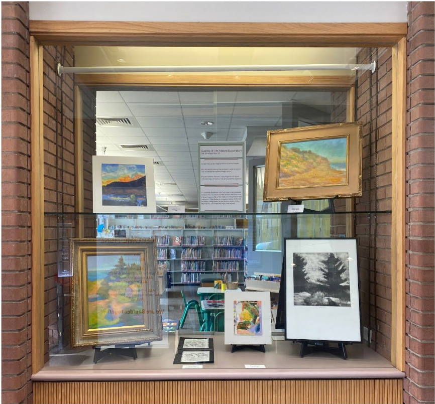
Current Exhibition (2022)